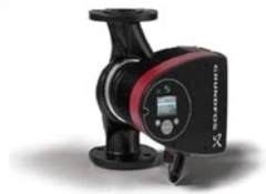
MAGNA3 Single Head

NOTE: Items marked */** may require spacer kits when replacing MAGNA or UPS/D models. Please see spacer kits listed on page P10.