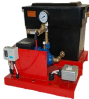
Spartan “Spa-Base” Unit

Fill pressure: 0.5 - 3.0 Bar Electrical: 240v, 1-phase Full load current (FLC): 2.6A Connections: Water supply: ½” bsp System: ½” bsp Weight: 25Kg Dimensions (LxHxD): 710mm x 425mm x 450mm