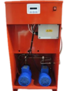
Inside "SU2 Micro"