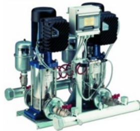
Twin pump, inverter-controlled