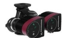
MAGNA1 Twin Head