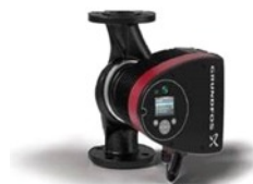
MAGNA 3 Single Head