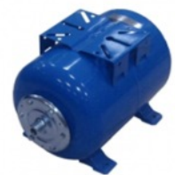
“RD” 10 Bar