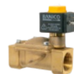
23x & coil