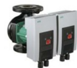
Yonos MAXO D

Spartan Controls can supply the full range of Wilo pump equipment. Please contact the office for any product not listed, or for a tailored quote.