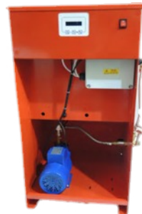
Inside "SU1 Micro"