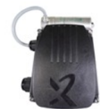
Replacement Term. Box