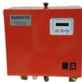
Outside view (Micro)