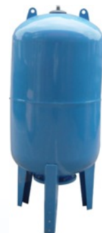
“RD” 16 Bar