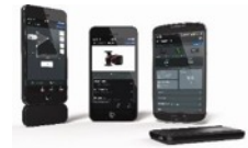
Go Remote Range