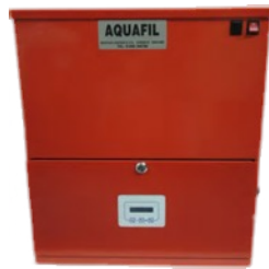
Outside view (Micro)