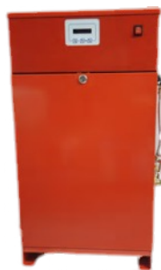
Outside view (Micro)