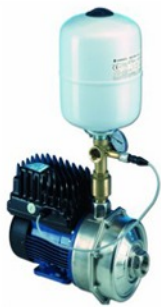
Single pump, inverter-controlled