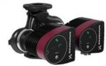
MAGNA1 Twin Head

NOTE: Items marked */** may require spacer kits when replacing MAGNA or UPS/D models. Please see spacer kits listed on page P10.