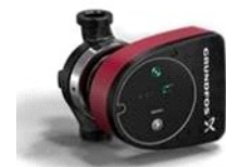
MAGNA1 Single Head

NOTE: Items marked */** may require spacer kits when replacing MAGNA or UPS/D models. Please see spacer kits listed on page P10.