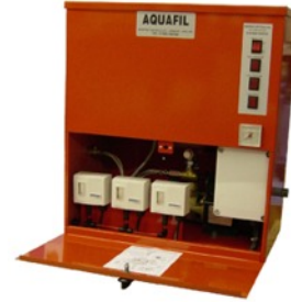
Inside view (Standard)