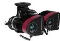
MAGNA3 D Twin Head

NOTE: Items marked */** may require spacer kits when replacing MAGNA or UPS/D models. Please see spacer kits listed on page P10.