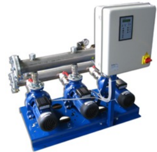
Three pump, inverter-controlled