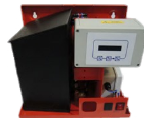
Inside view (Micro)