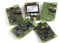
Data Cards for AutoAdapt