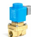
032U5252 & coil