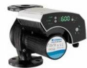
Ecocirc XL Plus