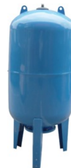
“RD” 16 Bar