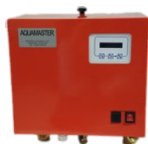
Outside view (Micro)

Fill pressure: 0.5 - 4.0 Bar Electrical: 240v, 1-phase Full load current (FLC): 1A Weight: 8Kg Dimensions (HxWxD): 320mm x 355mm x 205mm