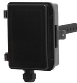
DTR-CO2-TH Duct Transmitter