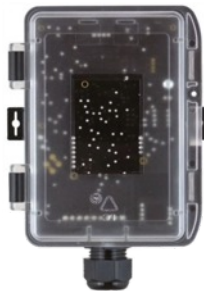
DSS-CO2TH Smart Sensor