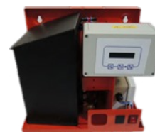
Inside view (Micro)