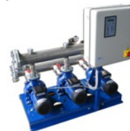
Three pump, inverter-controlled