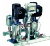
Twin pump, inverter-controlled